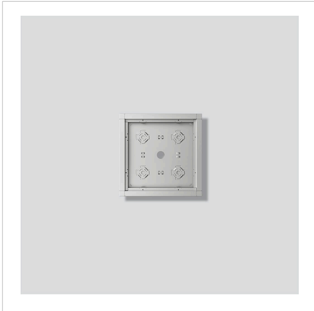
Surface-mount housing GA 612-2/2-01 SM