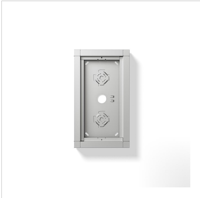
Surface-mount housing GA 612-2/1-01 SM