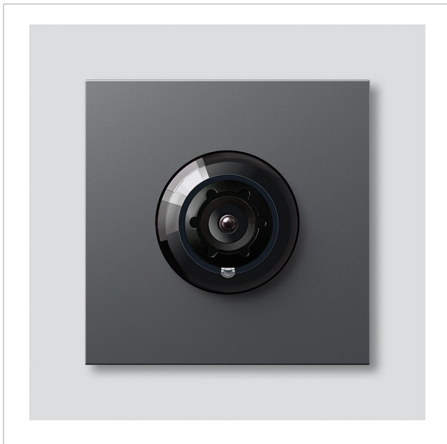
Bus camera 130 for Siedle Vario BCM 753-0 DG 210012159-00