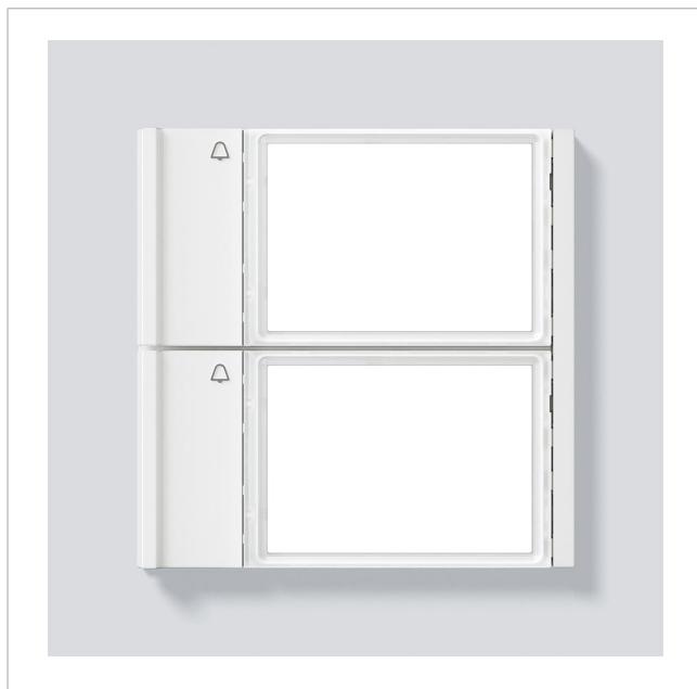
Call buttons for Siedle Vario TM 700-2-0 W 210011962-00