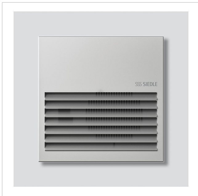
Bus door loudspeaker for Siedle Vario BTLM 750-0 SM