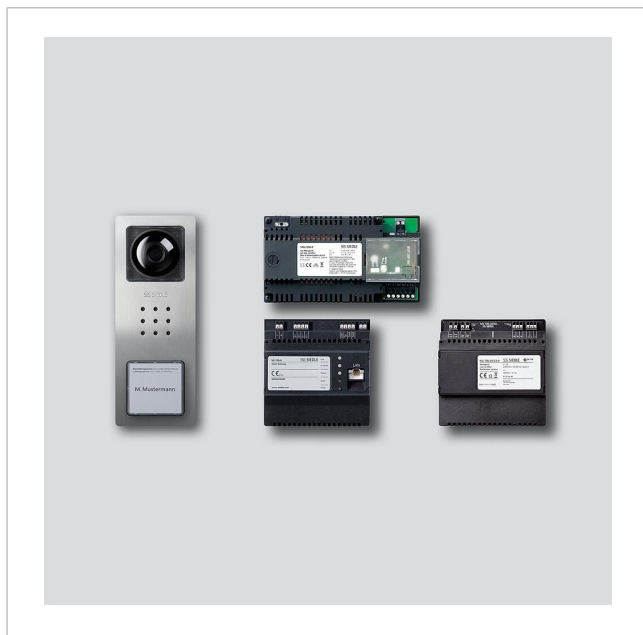
Smart Gateway starter kit for surface mounting SET CVSG 850-1-01 210009824-01