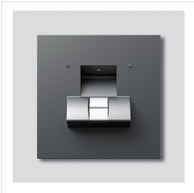
Fingerprint module FPM 600-0 DG 210009609-00