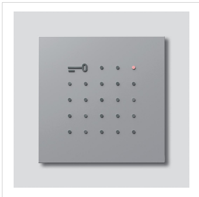
Electronic-key reading module ELM 600-0 SM 210008428-00