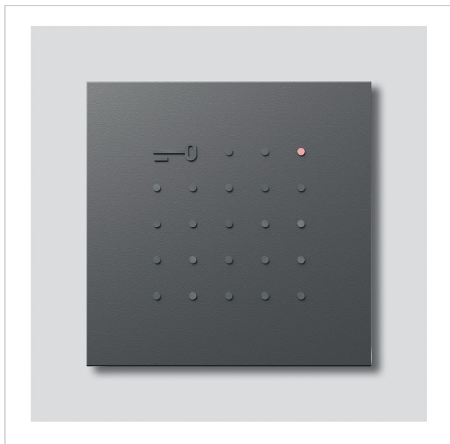
Electronic-key reading module ELM 600-0 DG 210008427-00