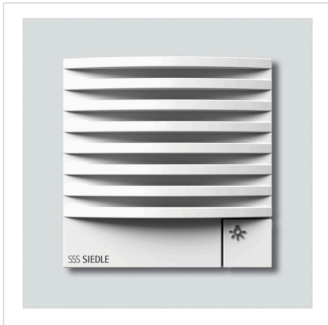
Access door loudspeaker module Plus ATLM 671-0 W 210007344-00