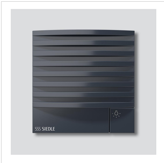
Access door loudspeaker module Plus ATLM 671-0 AG 210007341-00