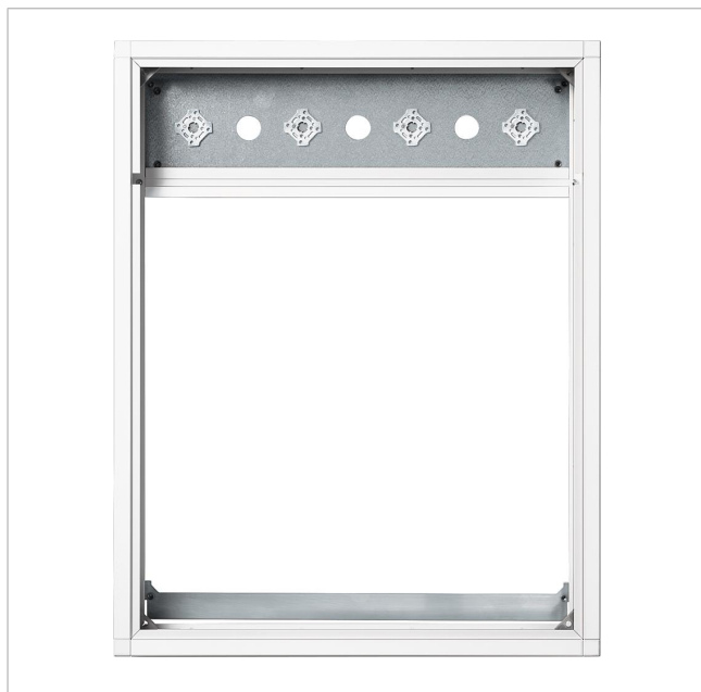
Combination frame KR 614-1/1 AG 210005023-00