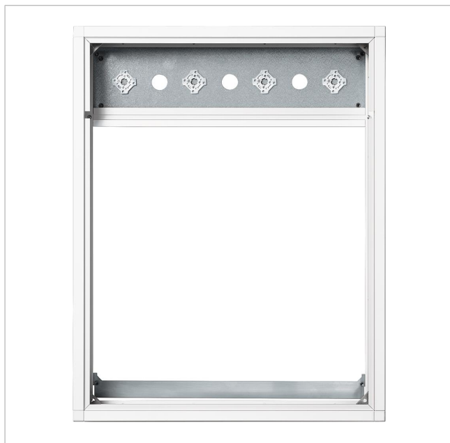
Combination frame KR 614-1/1 AG