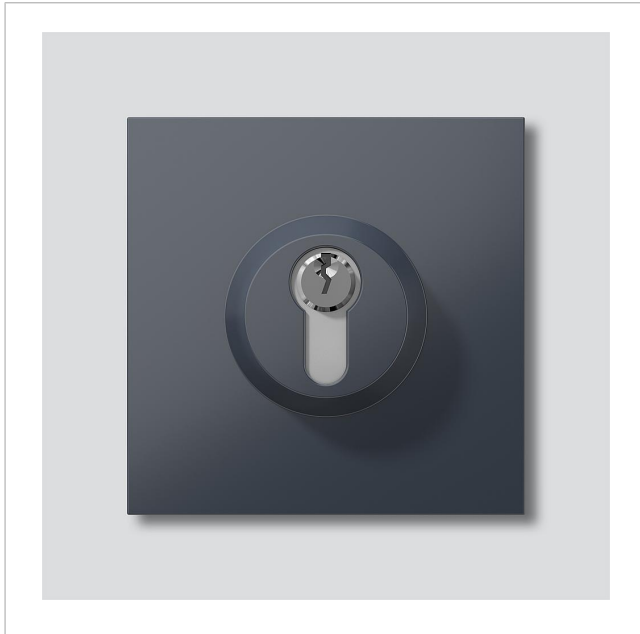
Lock module SM 611-01 AG 210004992-00