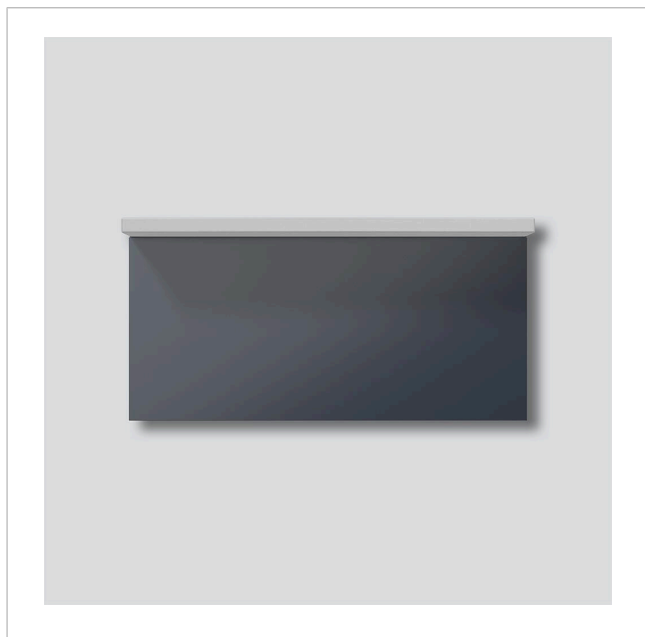
LED surface area light LEDF 600-4/2-0 AG