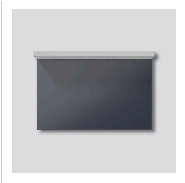
LED surface area light LEDF 600-3/2-0 AG