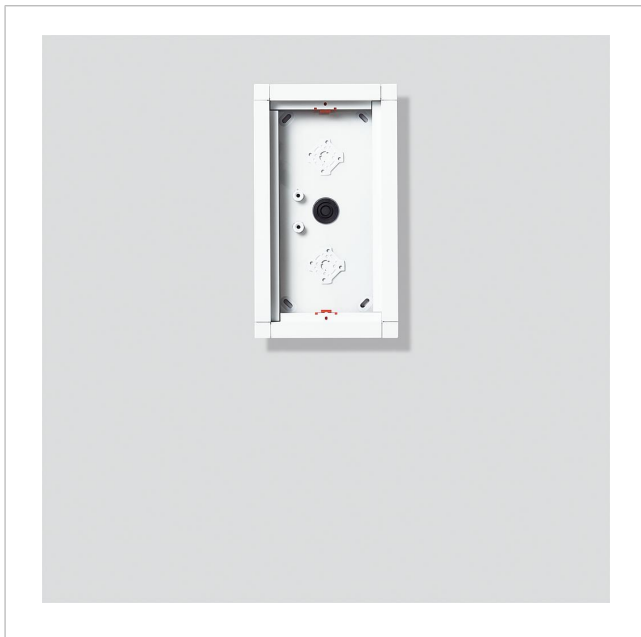
Surface-mount housing GA 612-2/1-0 AG