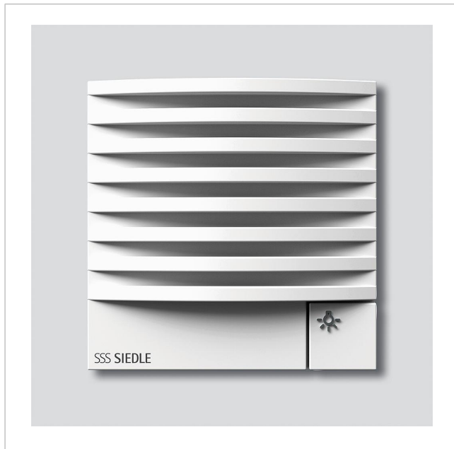
Door loudspeaker module Multi TLM 645-02 W 200087560-00