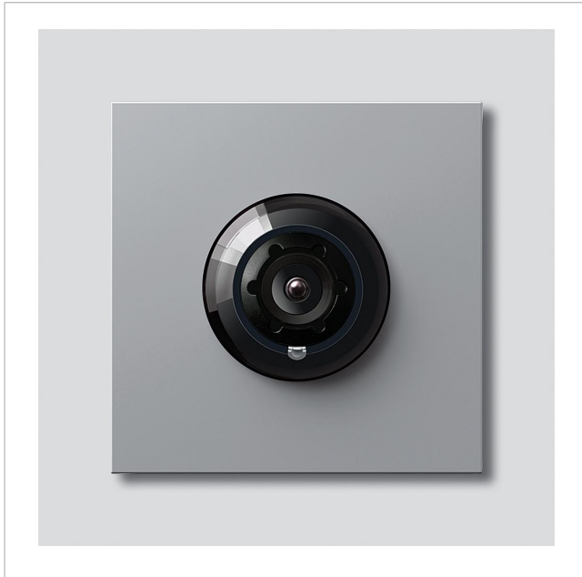
Bus camera 180 for Siedle Vario BCM 658-02 SM 200049363-01