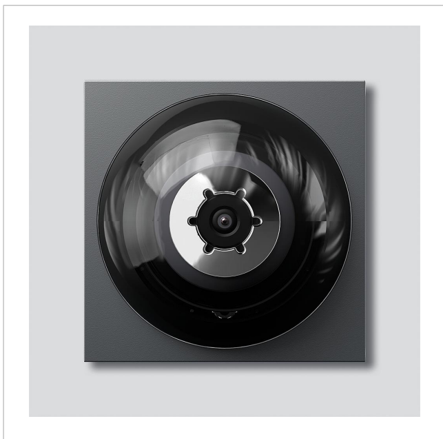
Bus camera 80 for Siedle Vario BCMC 650-03 DG 200049026-01