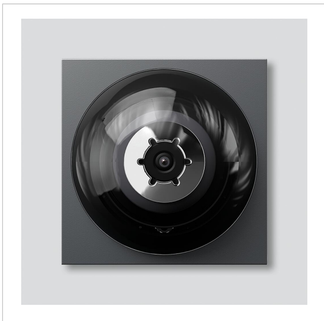
Bus camera 80 for Siedle Vario BCMC 650-03 DG 200049026-01