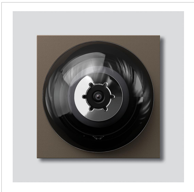
Bus camera 80 for Siedle Vario BCMC 650-03 BG 200049025-01