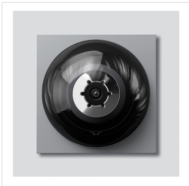
Bus camera 80 for Siedle Vario BCMC 650-03 SM 200049022-01