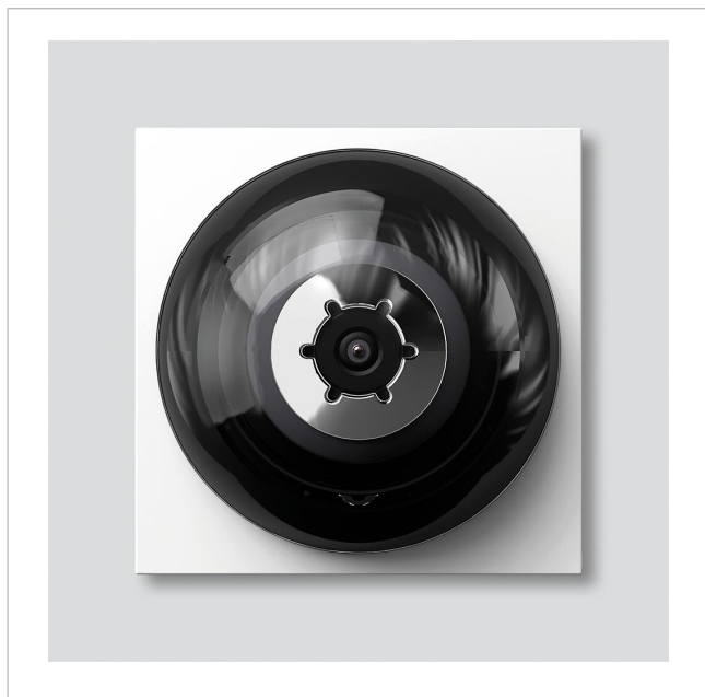
Bus camera 80 for Siedle Vario BCMC 650-03 W 200049021-01