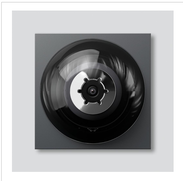
Access camera 80 for Siedle Vario ACM 670-03 DG 200049019-01