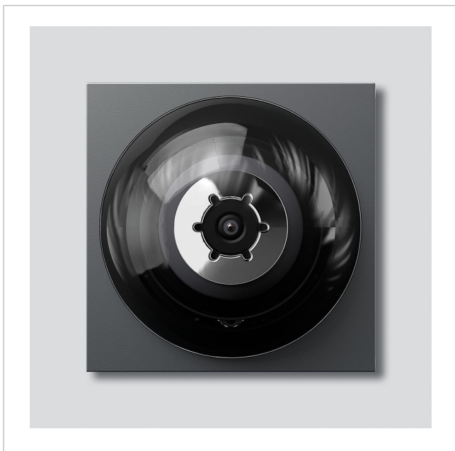
Access camera 80 for Siedle Vario ACM 670-03 DG 200049019-01