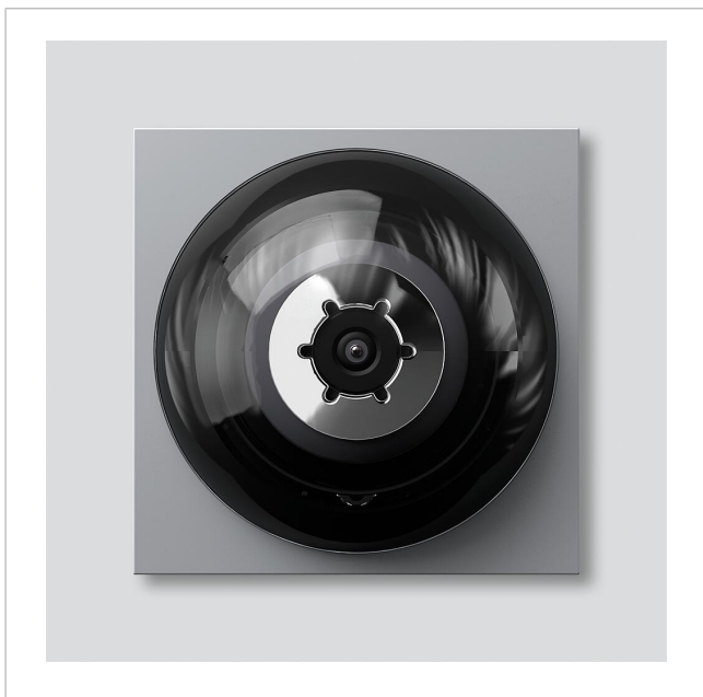
Access camera 80 for Siedle Vario ACM 670-03 SM 200049015-01