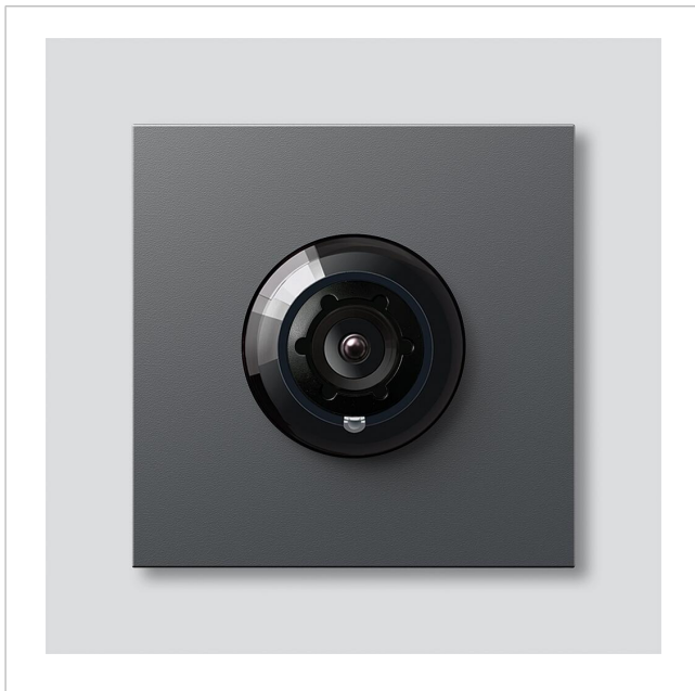
Bus camera 130 for Siedle Vario BCM 653-03 DG 200048249-03