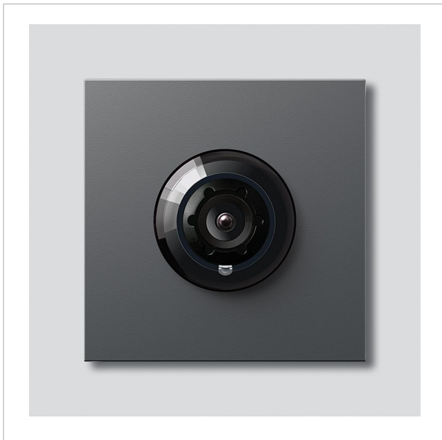
Bus camera 130 for Siedle Vario BCM 653-03 DG 200048249-03