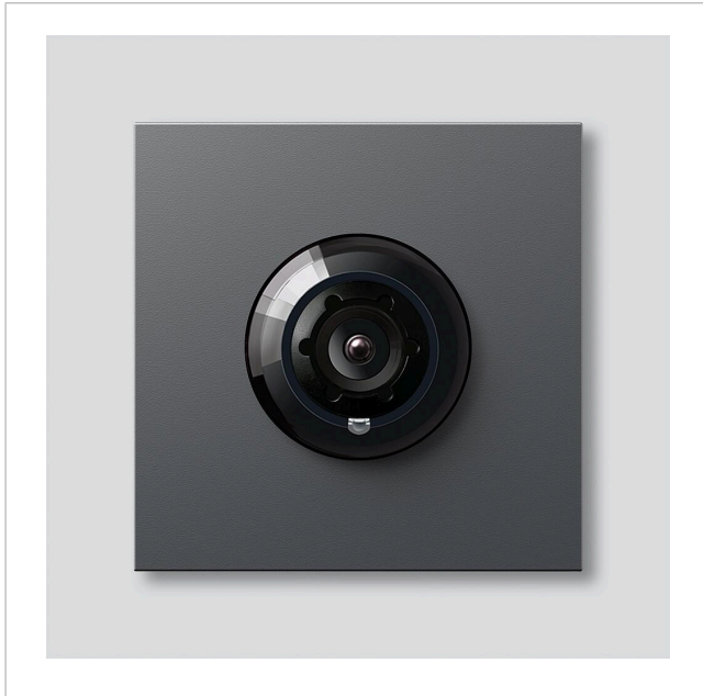
Bus camera 130 for Siedle Vario BCM 653-03 DG 200048249-03