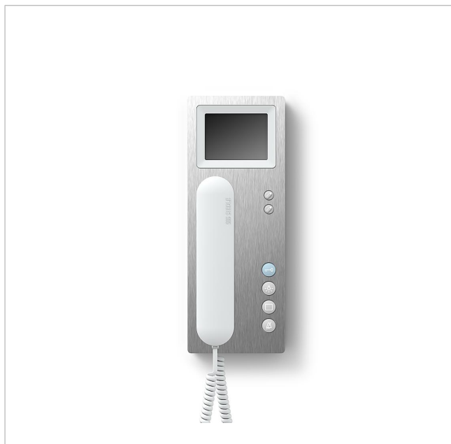
Standard bus telephone with colour monitor BTSV 850-03 E/W