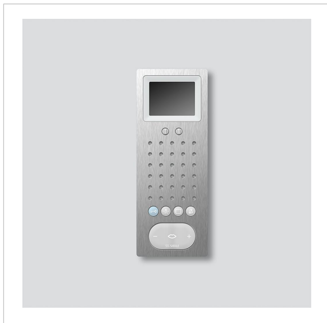
Standard handsfree bus telephone with colour monitor BFSV 850-03 E/W 200044603-00