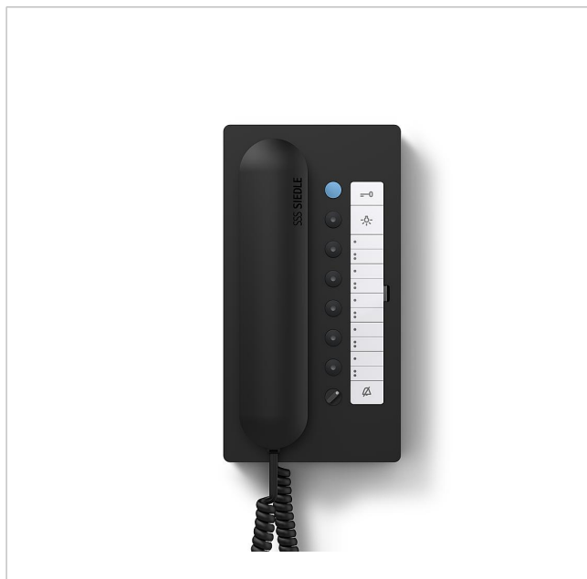
Comfort in-house telephone HTC 811-0 S 200044451-00