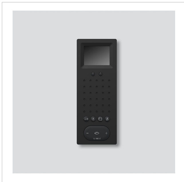
Standard handsfree bus telephone with colour monitor BFSV 850-03 S 200044443-00