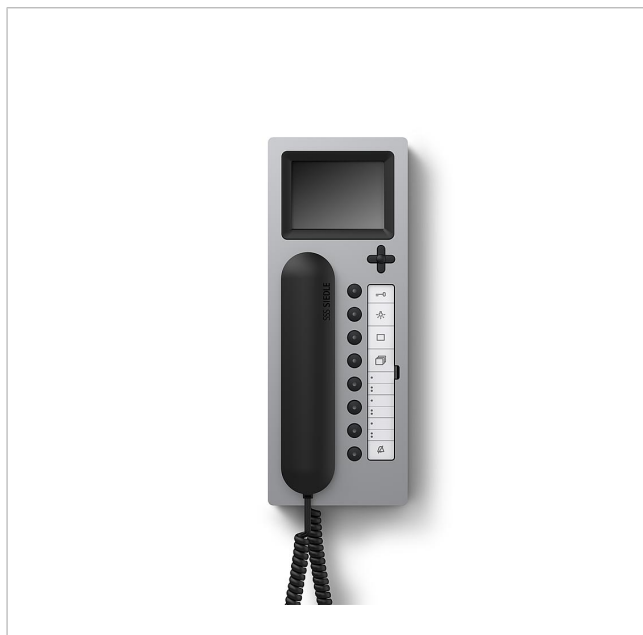
Access in-house telephone AHT 870-0 A/S 200042031-00