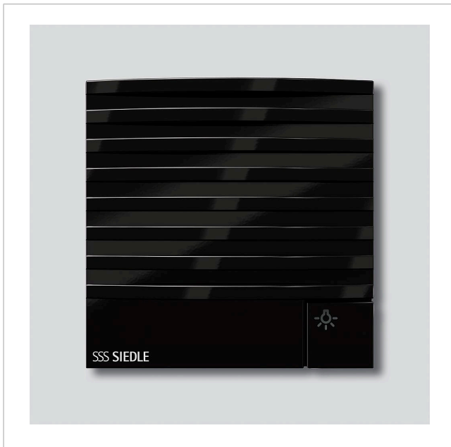
Access door loudspeaker module ATLM 670-0 SH