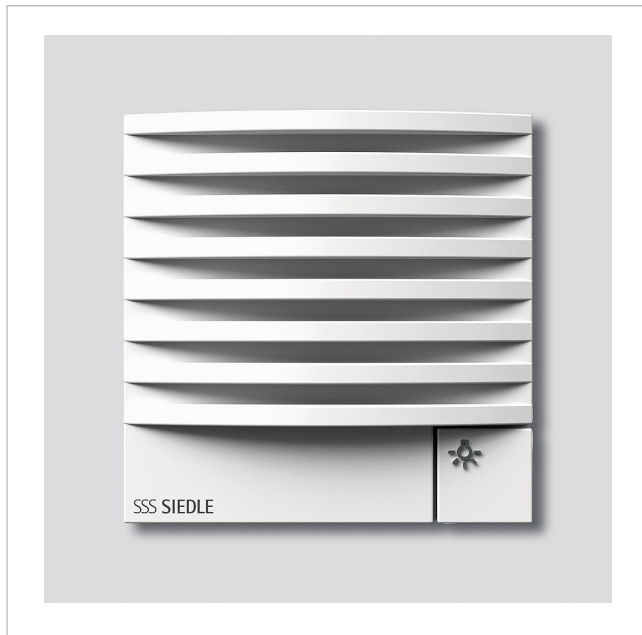
Access door loudspeaker module ATLM 670-0 W