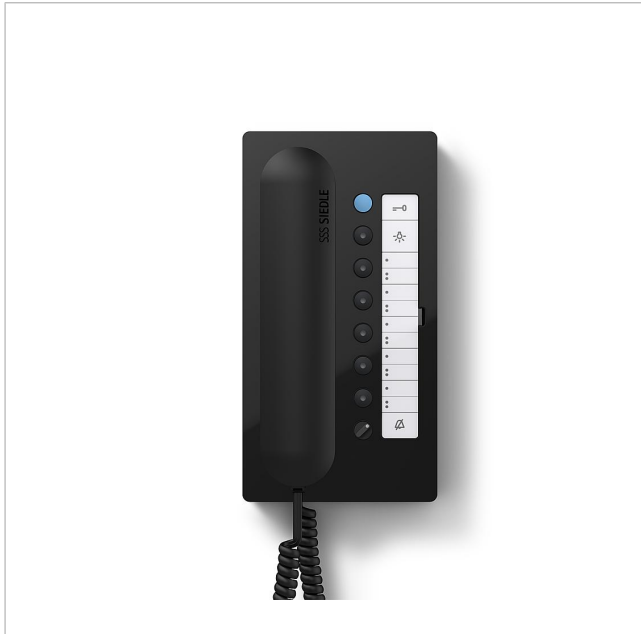
Comfort in-house telephone HTC 811-0 SH/S 200041540-00