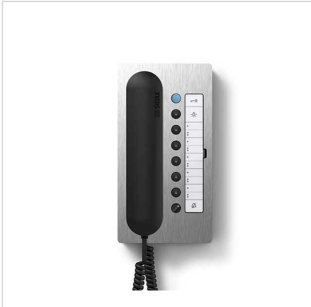
Comfort in-house telephone HTC 811-0 E/S 200041535-00