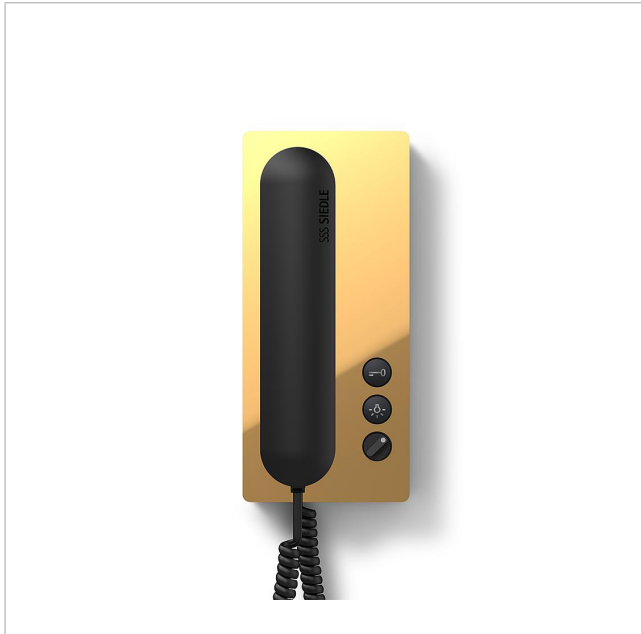
Standard in-house telephone HTS 811-0 EG/S 200041529-00