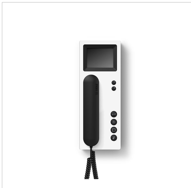
Standard bus telephone with colour monitor BTSV 850-03 WH/S