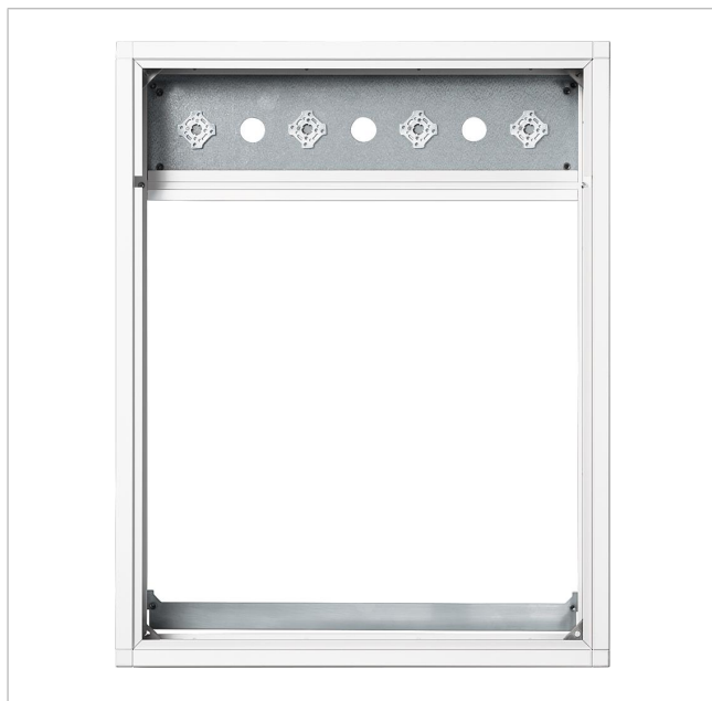
Combination frame KR 614-1/1 DG 200040857-00