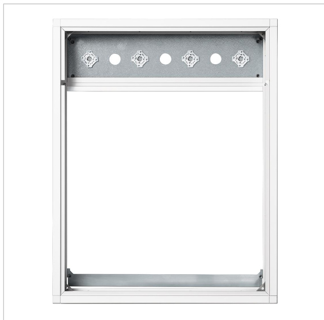
Combination frame KR 614-1/1 SM 200040853-00