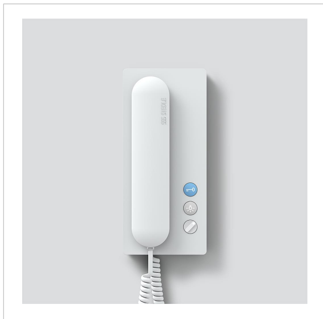
Analogue in-house telephone HTA 811-0 W 200039976-00