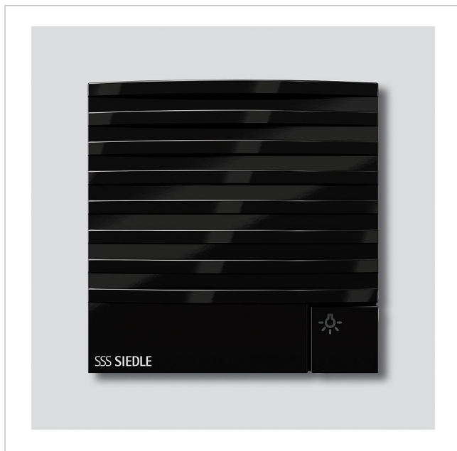
Bus door loudspeaker module BTLM 650-04 SH 200038827-00