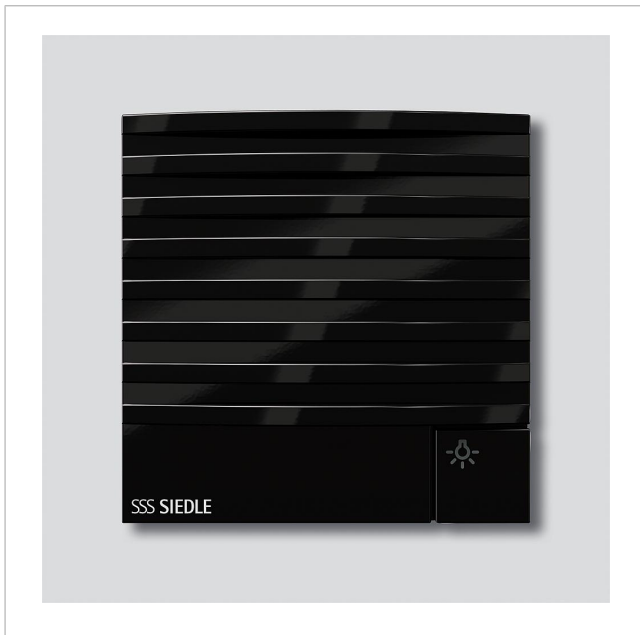
Door loudspeaker module TLM 612-02 SH 200038811-00