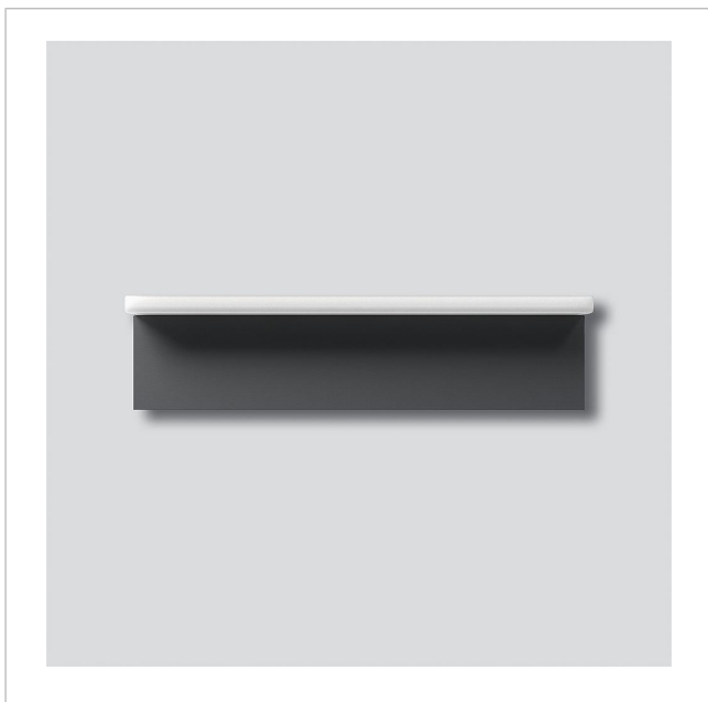
LED surface area light LEDF 600-4/1-0 DG