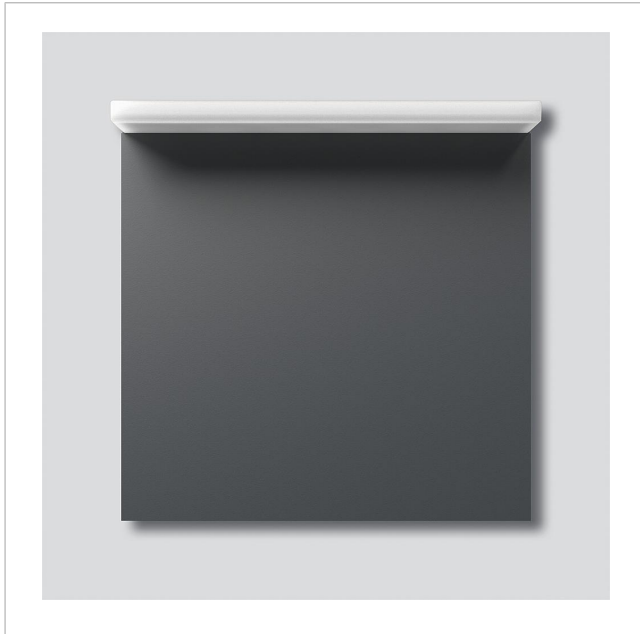
LED surface area light LEDF 600-3/3-0 DG