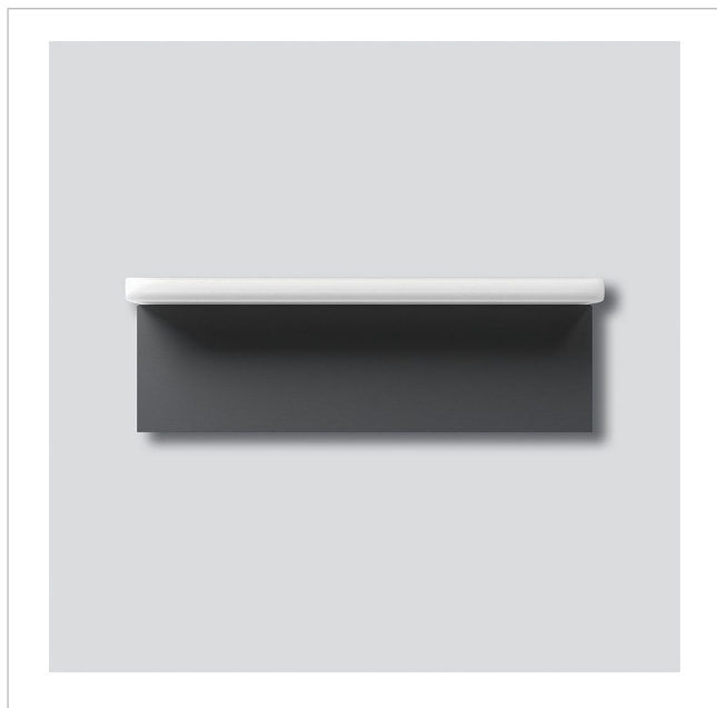
LED surface area light LEDF 600-3/1-0 DG