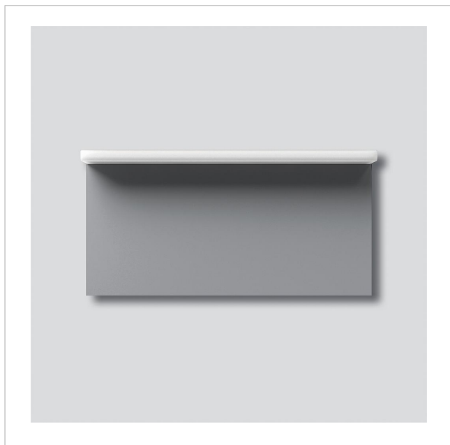
LED surface area light LEDF 600-4/2-0 SM