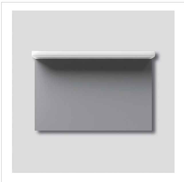
LED surface area light LEDF 600-3/2-0 SM