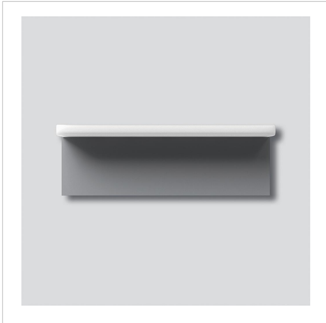
LED surface area light LEDF 600-3/1-0 SM