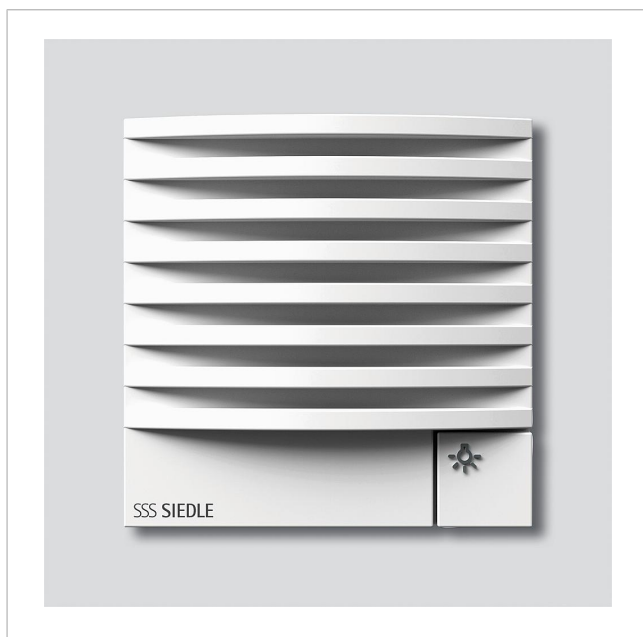
Door loudspeaker module TLM 612-02 W 200036810-00